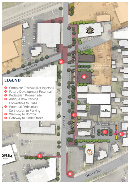
Proposed Project: Linda Street

Core Projects are selected areas in Rocky River that propose detailed development strategies for the future. Thus far the plan has identified up to ten potential core projects that could spark further development. Most of these projects are focused around specific areas or corridors. Examples range from reducing the number of lanes on the eastern section of Hilliard Boulevard to creating new, flexible thoroughfare opportunities, to developing a more cohesive corridor along Wooster Road. Another prominent project is the transformation of Linda Street with an enhanced pedestrian promenade. Downtown River, Bradstreet's Landing, Center Ridge Road, and the Municipal Center are among the remaining projects.